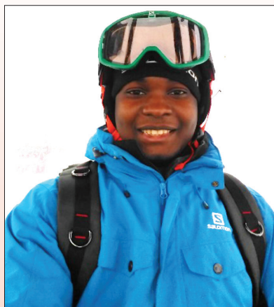
These days I can't wait for the cold period to enjoy winter games.

Currently I am in my final year pursuing a Bachelor of Pharmacy at the School of Pharmaceutical Sciences and Pharmacy, Hokkaido University. I research about rational design of protein-like molecules (foldamers) as medium-molecule drug candidates. I also train to become an all-round clinical pharmacist. My current research has deepened my interest in proteins and nucleic acids and for that reason, I intend to pursue a Ph.D. in biologics drug design upon graduation.