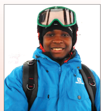
These days I can't wait for the cold period to eniov winter games.

Currently I am in my final year pursuing a Bachelor of Pharmacy at the School of Pharmaceutical Sciences and Pharmacy, Hokkaido University. I research about rational design of protein-like molecules (foldamers) as mediummolecule drug candidates. I also train to become an all-round clinical pharmacist. My current research has deepened my interest in proteins and nucleic acids and for that reason, I intend to pursue a Ph.D. in biologics drug design upon graduation